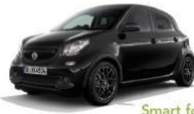
Smart forfour Electric Drive