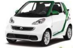
Smart fortwo Cabrio Electric Drive