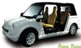
Bee Bee EXCLUSIVITY!