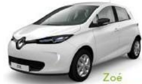
Zoé de Renault