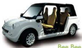
Bee Bee EXCLUSIVITY!