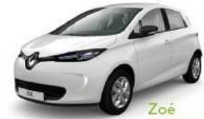
Zoé de Renault