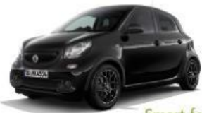
Smart forfour Electric Drive